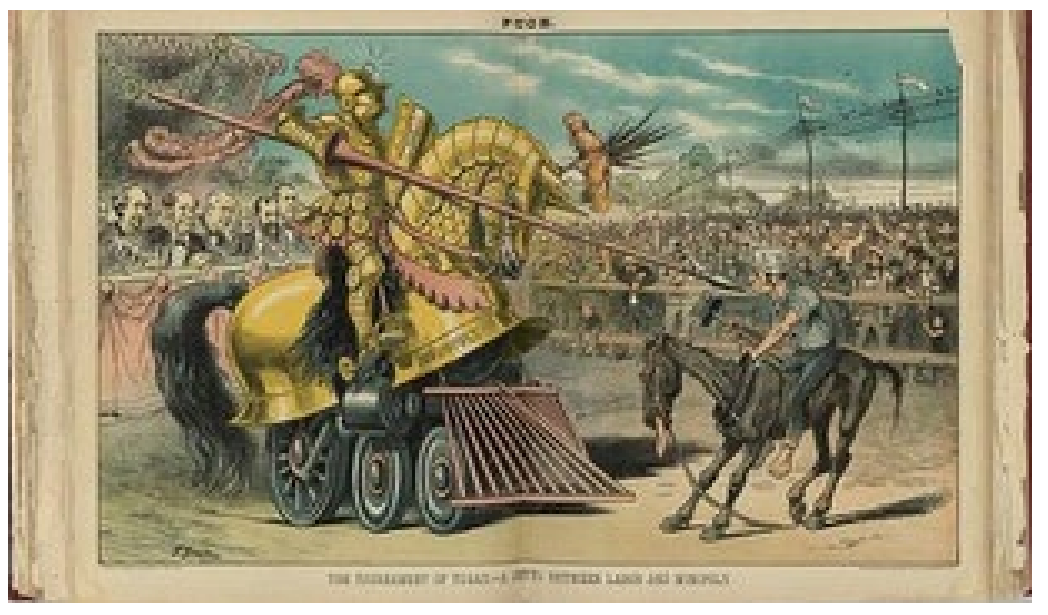
An 1883 cartoon by Friedrich Graetz depicting 'The tournament of today: a set to between labor and monopoly'.

Corporate lobbying soon eliminated the publicity of corporate tax returns, but the corporate tax itself proved more resilient. During World War I, income tax rates were raised dramatically to finance the war effort, and this included the corporate tax rate, which was raised to 12%. In addition, from 1917 onward a series of excess profits and war profits taxes were imposed on corporations that profited from the war. The war profits tax was levied on corporate profits above a three-year pre-war average,