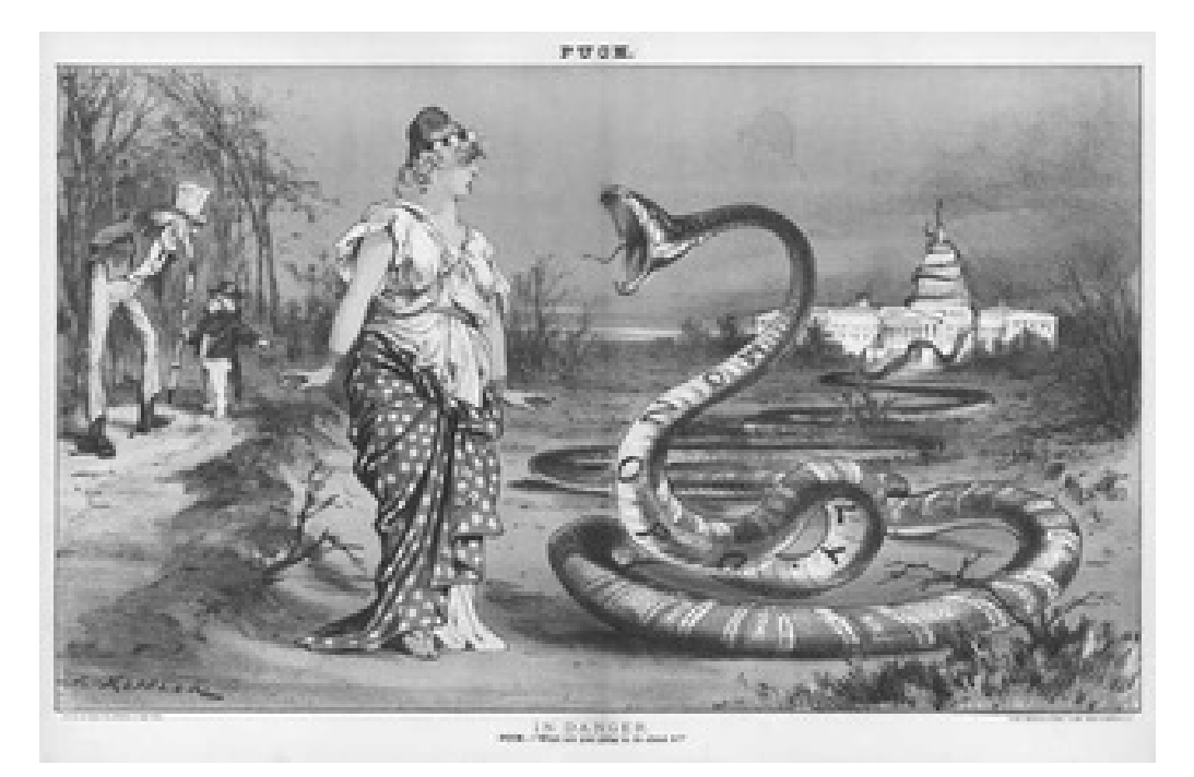
In 1881 America is menaced by the serpent of monopoly. Puck magazine asks Uncle Sam what he's going to do about it.

profitability, thus share prices, and thus their personal wealth) which drive the decisionmaking of these corporate leaders.