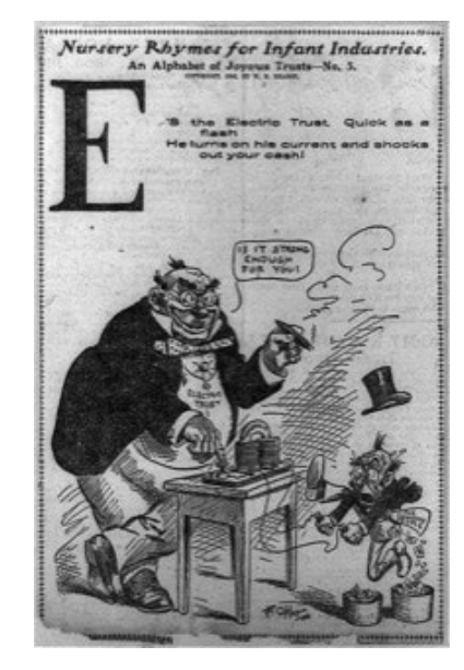
In this 1901 Frederick Opper cartoon the Electric Trust uses an electrical device, monopoly, to shock the common people.