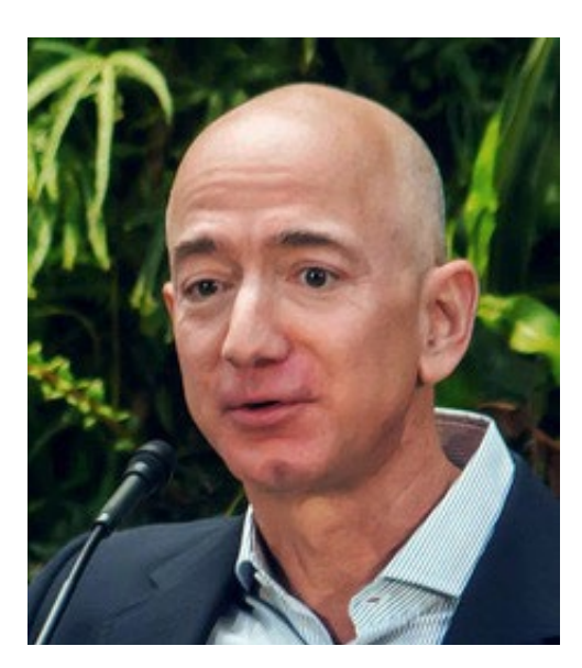
Jeff Bezos, the head of Amazon, is one of the billionaire 'blockholders' whose fortune derives from control of a company with massive market power.

A wealth tax is, as the name suggests, a tax - thus far proposed as around 1-2% - on the underlying value of the stock of the assets that make up the vast majority of multimillionaire and billionaires' holdings, including real estate, cash, stocks and bonds, and certain business assets.<sup>3</sup> Seen as fundamentally fair and highly-targeted, the idea of a wealth tax generates broad public support across the political spectrum,<sup>4</sup> and its popularity has helped garner momentum for progress on various ways to tax the ultrawealthy - perhaps best evidenced by how close a 2021 proposal by Chairman of the US Senate Finance Committee for a Billionaire's Income Tax came to legislative